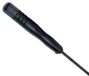
Calibration screwdriver included