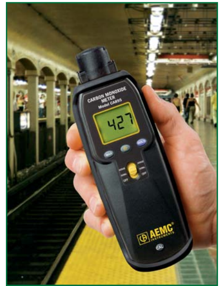
The Model CA895 can be used to monitor CO levels in subway stations.