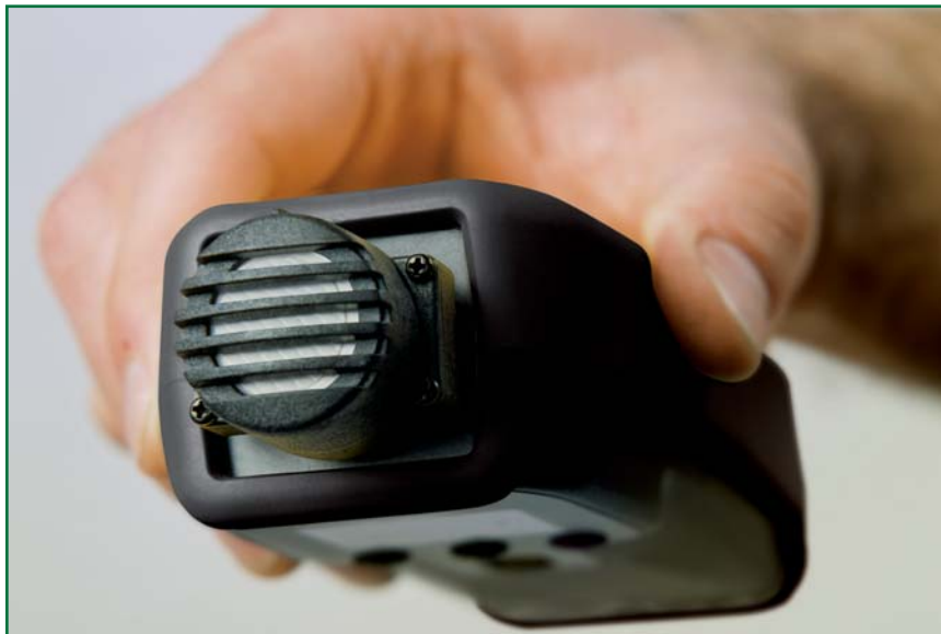
The Model CA895's catalytic sensor does not consume any chemical substances.