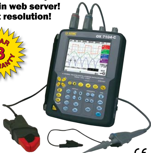
Model OX 7104-C