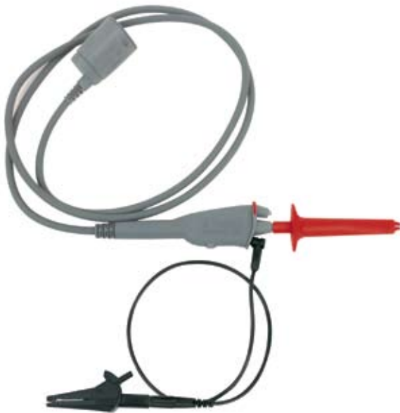
Model HX0071 probe adapter set shown attached to a PRHX1 10/1 probe