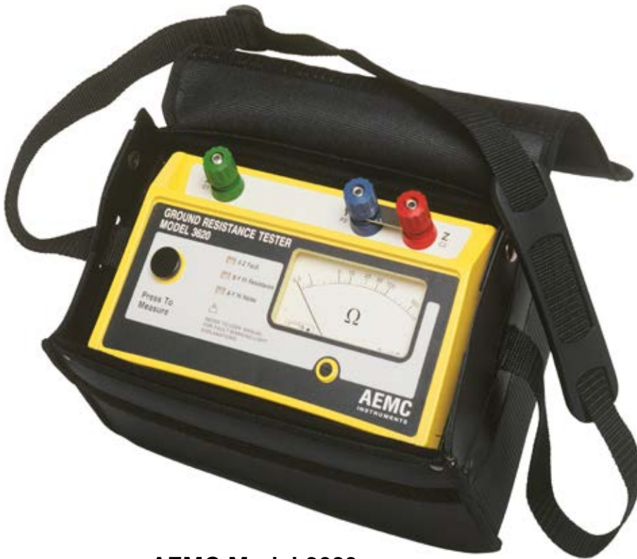
AEMC Model 3620

W hatever your ground resistance testing needs, AEMC has an instrument that meets your requirements: