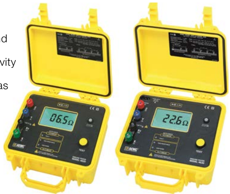
AEMC Models 4620 and 4630

High soil resistivity requires instruments that can produce test currents greater than the 10mA current typically provided by lower-cost instruments. The Models 6470-B, 6471, and 6472 (below) provide test currents up to 250mA. These instruments