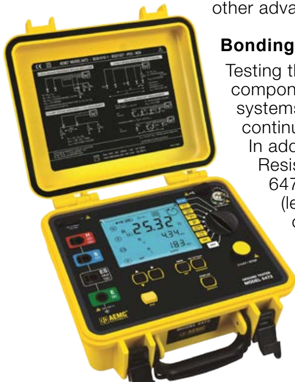
AEMC Model 6472

In addition to the Ground Resistance Testers Models 6470-B, 6471, and 6472 (left), AEMC offers micro-ohmmeters (for example, the Model 6240, bottom right) that can be used in this application.