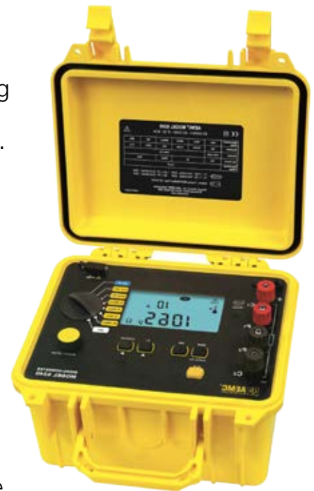
AEMC Micro-Ohmmeter Model 6240

B, 6471, and 6472 provide this capability, as do the Models 6416 and 6417 Clamp-On Ground Testers. Note that the latter two instruments are the only clamp-on hand-held ground resistance testing products in the industry that offer test frequency selection.