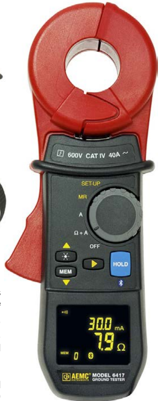
AEMC Model 6417

In addition, the hand-held Clamp-On Ground Resistance Tester Models 6416 and 6417 (right) measure ground rod and grid resistance and impedance without requiring auxiliary rods.