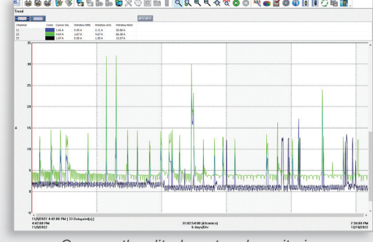
One month split-phase trend monitoring.

Create, view, edit and store reports from the instrument's recorded data with the included DataView® software.