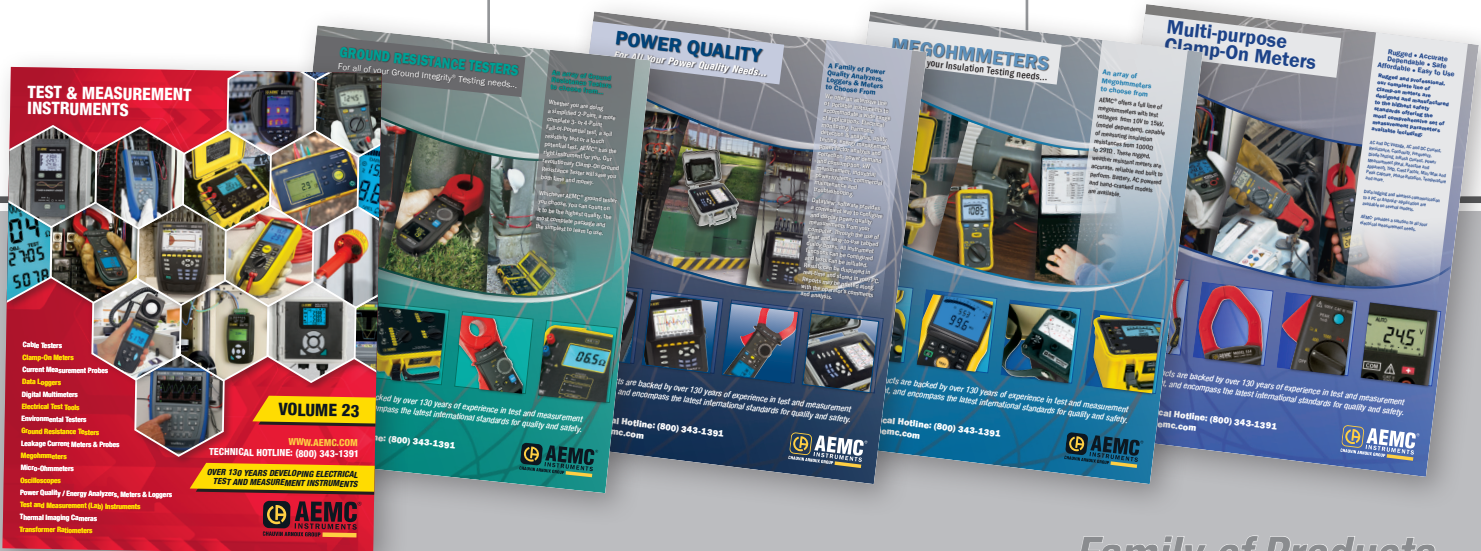
Family of Products

12-16 Rue Sarah Bernhardt 92600 Asnières-Sur-Seine, FR Tel +1 33 1 44 85 45 85 Fax +1 33 1 46 27 73 89 info@chauvin-arnoux.com www.chauvin-arnoux.com