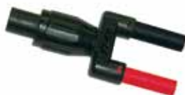
Banana (female) - BNC (male) Adaptor Catalog #2118.46 (optional)

**Available as special orders only. Contact customer service for current list price.