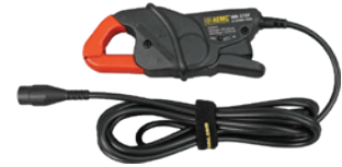
CATALOG #2153.02 Range 0.005 to 120A