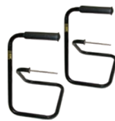
REEL CADDY Catalog #2135.85 Set of (2), for use with ground kit spools