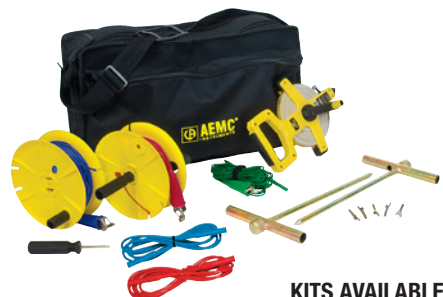
KITS AVAILABLE SHOWN: CATALOG #2135.35